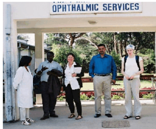
This is in Addis, but it could be Nekemte in the very near future!