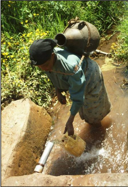
Collecting water from a capped spring at Tinja, near Nekemte – “All are happy to get clean water. We are now different from those animals drinking from the previous source....”