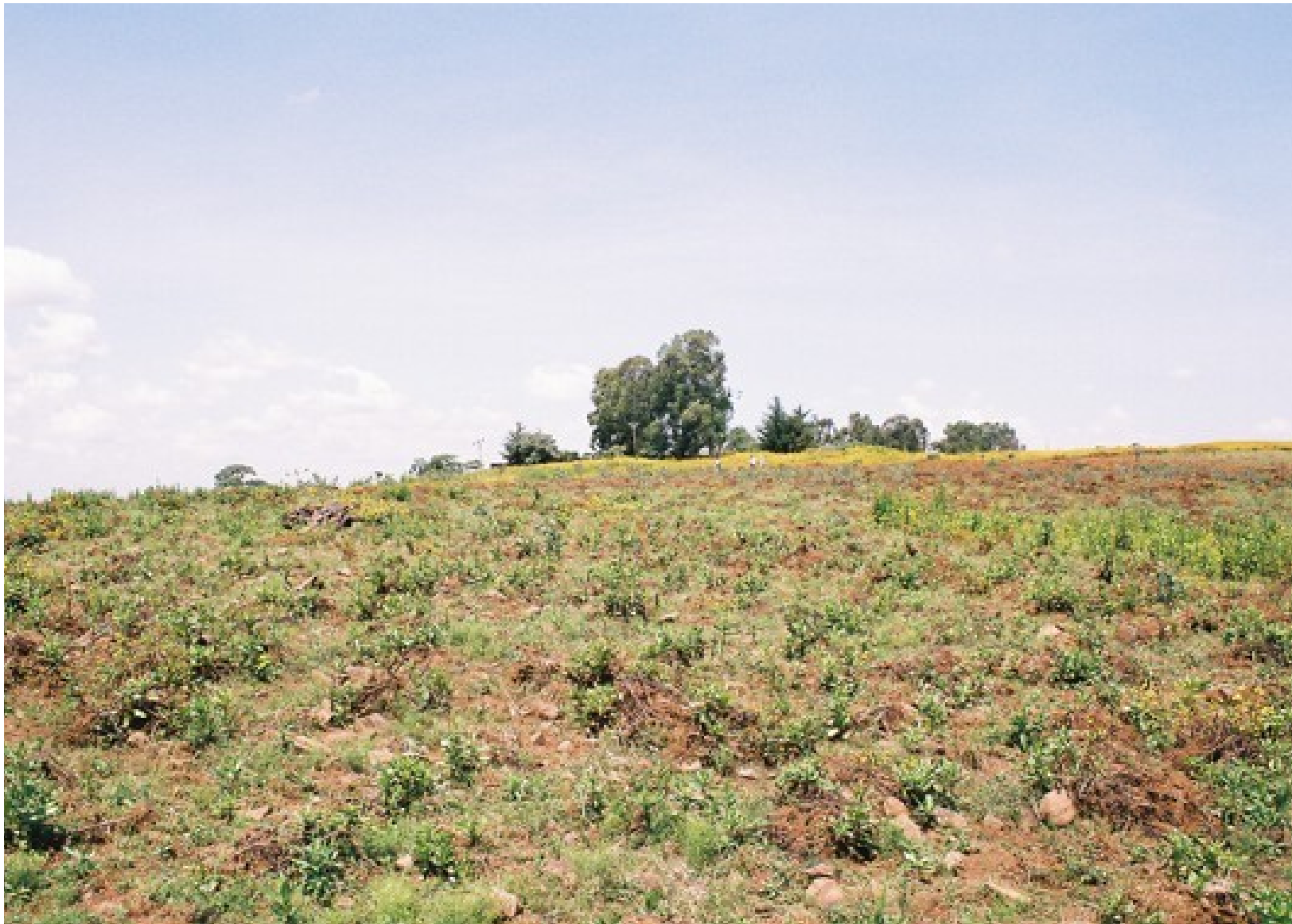
Eucalyptus planted on a bare hillside