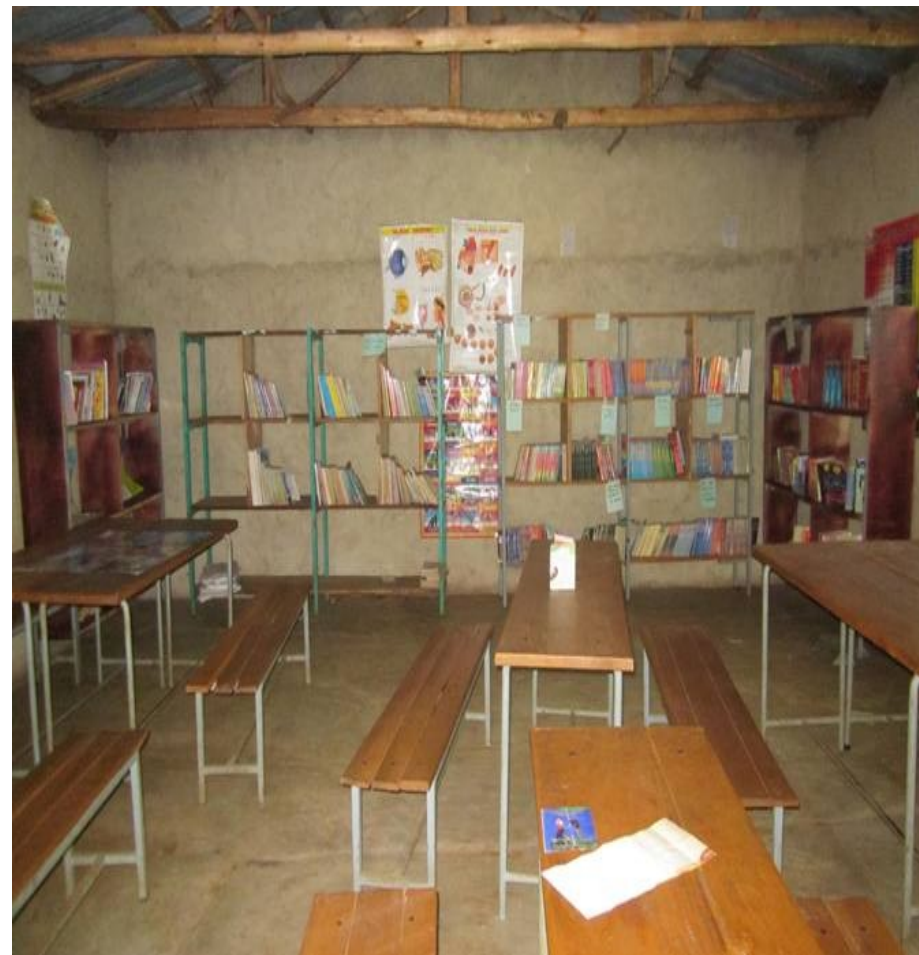
Leilisa school library in 2006 and in 2012