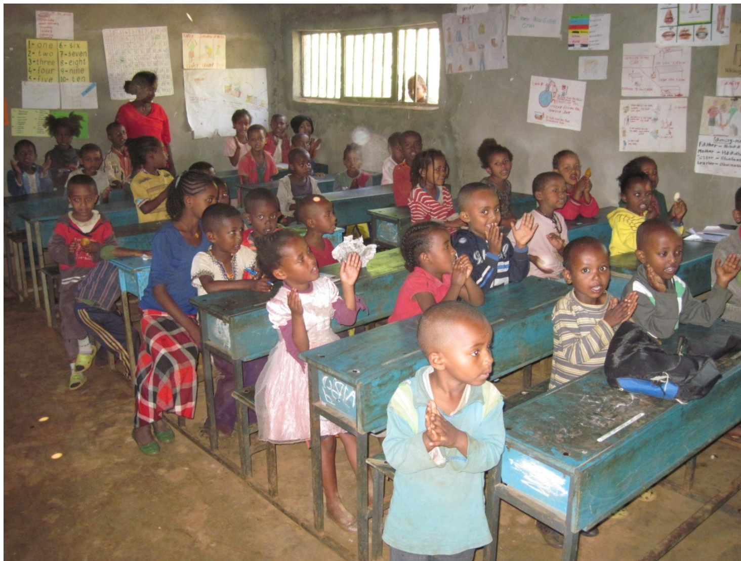
Starting in School – Grade 0