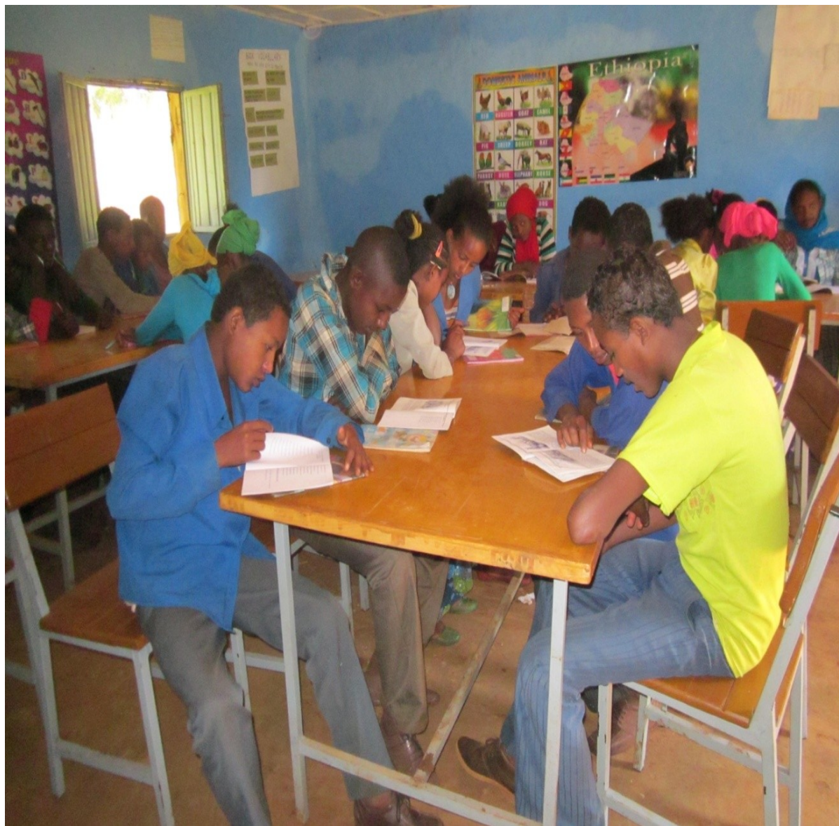
Masara Primary School library