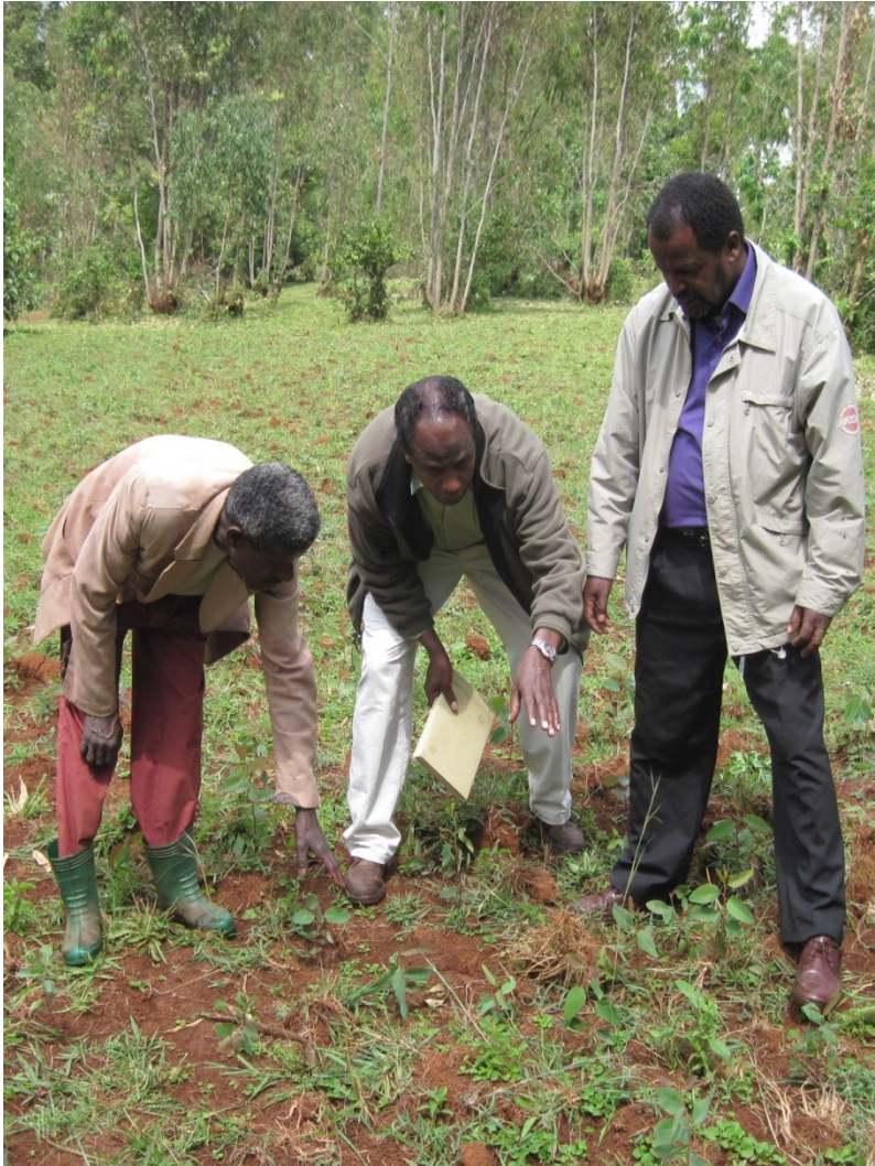
Eucalyptus at Sorga School